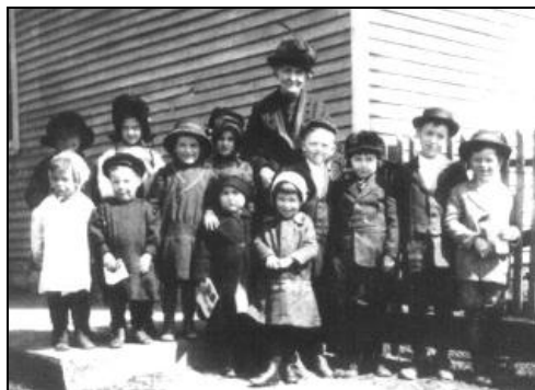
Sunday School Class First Christian Church, Albany, KY Fall 1915

continued from previous issue (Vol 5, Issue 6, Nov/Dec 2007)