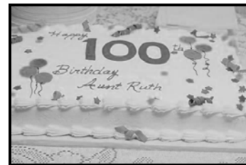
Happy 100 th Birthday!